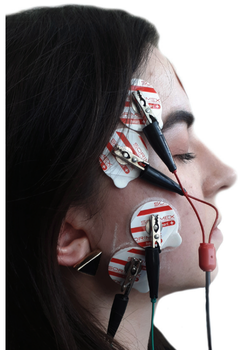
Fig. 2. The sEMG measurement